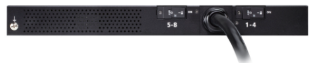
PG8208 Rear View